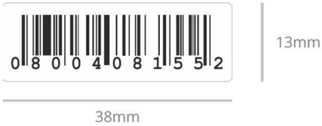
Barcode Stickers Displaying Helpline Telephone Number