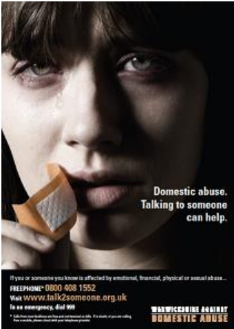
Double sided leaflet