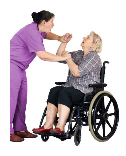
Physical Abuse could be someone hitting, slapping, pushing or kicking you.

Financial or material abuse could be someone taking your money or other things that belong to you.